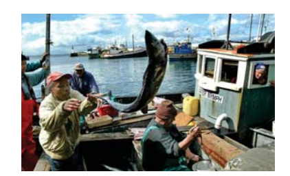
Small scale fisherman at work.

The partnership further demonstrates that a sector that is steeped in tradition can be enhanced through the use of technology whilst not compromising tradition. Abalobi will be the information management system for the small-scale fisheries industry according to the small-scale fisheries management unit in the Department of Agriculture, Forestry and Fisheries and has been successfully piloted in five communities as a catch-data monitoring app. In addition, the unit used an extension of the app to verify the number of active traditional fishers. With the data collected, fishers can prove that they make their living from the sea.